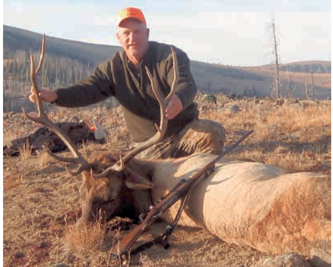
{\bf www.\ hiddencree} {\bf kout fitters.com}