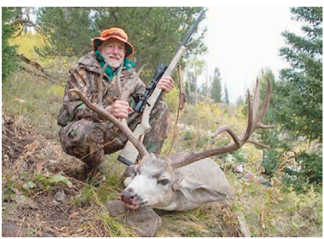
OFFERING: Trophy Elk • Deer • Bighorn Sheep • Texas Aoudad Sheep Summer Wilderness • Horseback Trips • Fishing • Camping • Photography