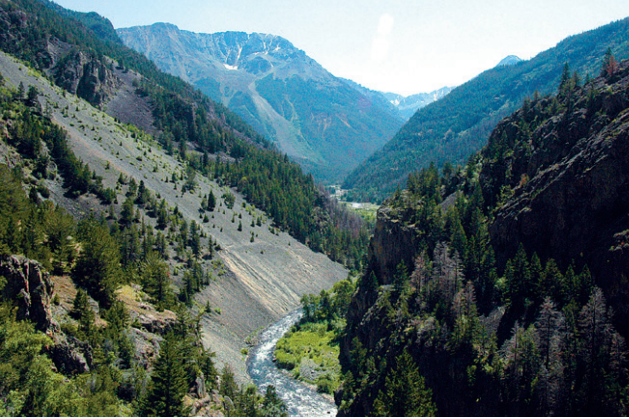
575 Road 11, Powell, WY 82435